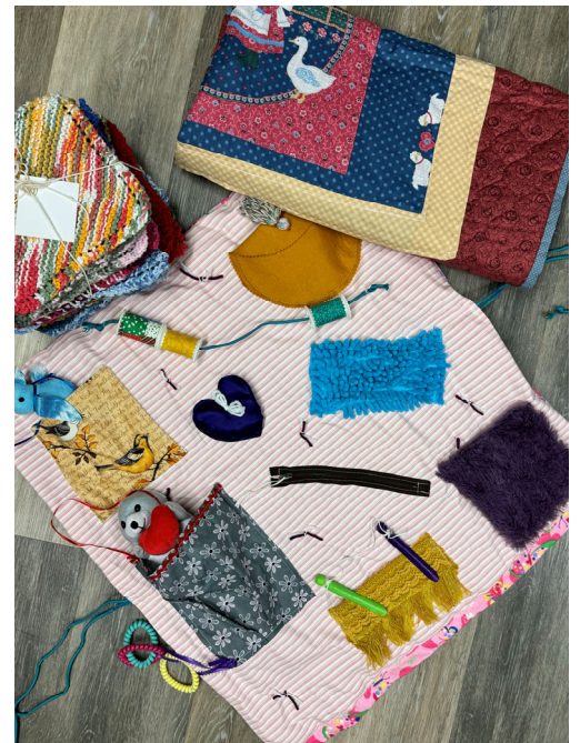
Handmade items from the Oregon Group Project.