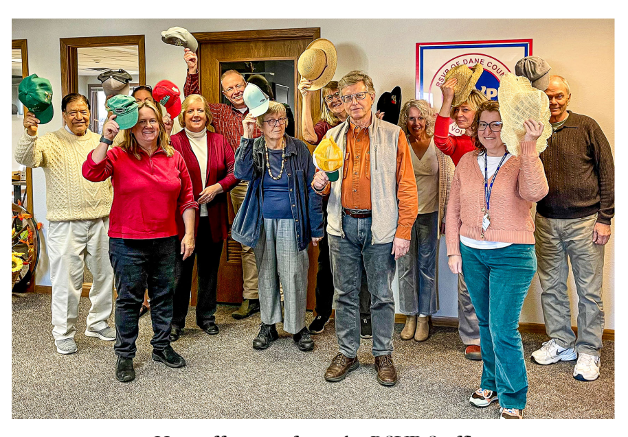
Hats off to you from the RSVP Staff!