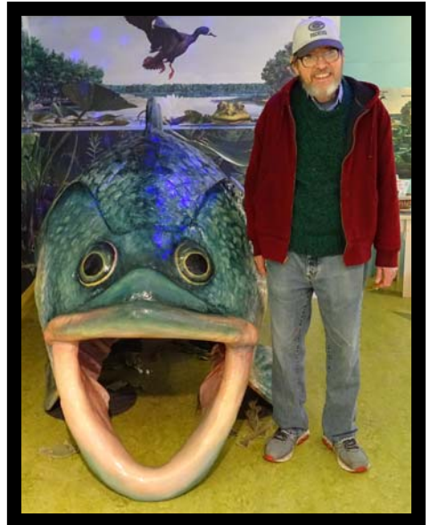
A Bus Buddy Visit to the Madison Children's Museum

“It makes life worth living. The best program ever!” ...Driver Services Passenger