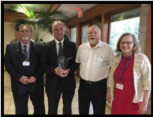
2017 Governor's Service Award Recipient