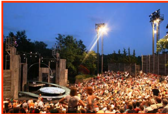
"Up the Hill" at American Players Theatre